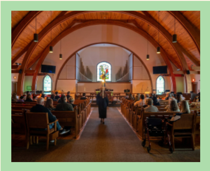
Easter Sunday Celebration