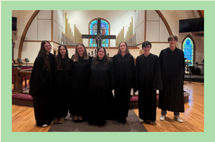
Good Friday Service