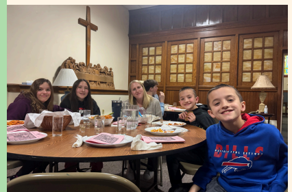
Fellowship and service work at Zion! Dinner church, God's Work. Our Hands. and the Lenten Collection.