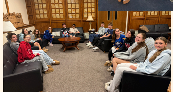
Faith Family Fun Nights! Get Air, Rock Climbing, and Rochester's Strong Museum