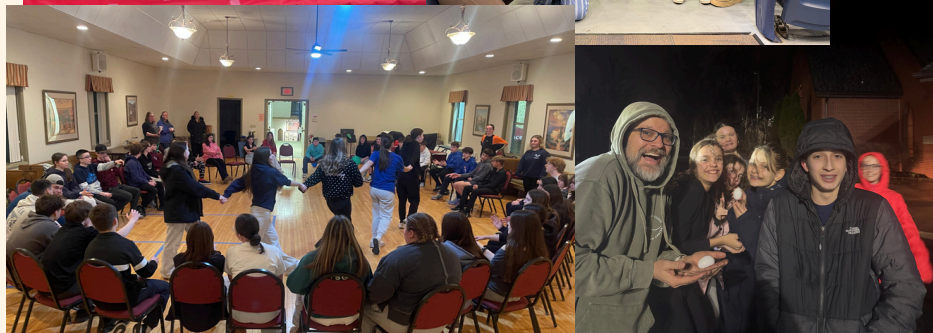
Zion Youth Group takes on the Chiavetta's Fundraiser, high school musicals, Lasertron Lock-In, and monthly youth nights!